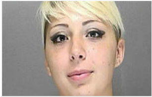
Cat-and-mouse game lands accused prostitute