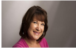
Free food at Walmart with new BOGO policy