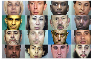
Photos: Cocaine Buyers Invited into Sunrise

New program could mean quick college degrees