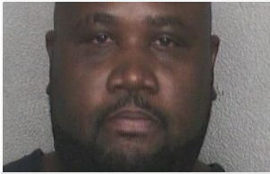
Restaurant patron punches waitress over bill...